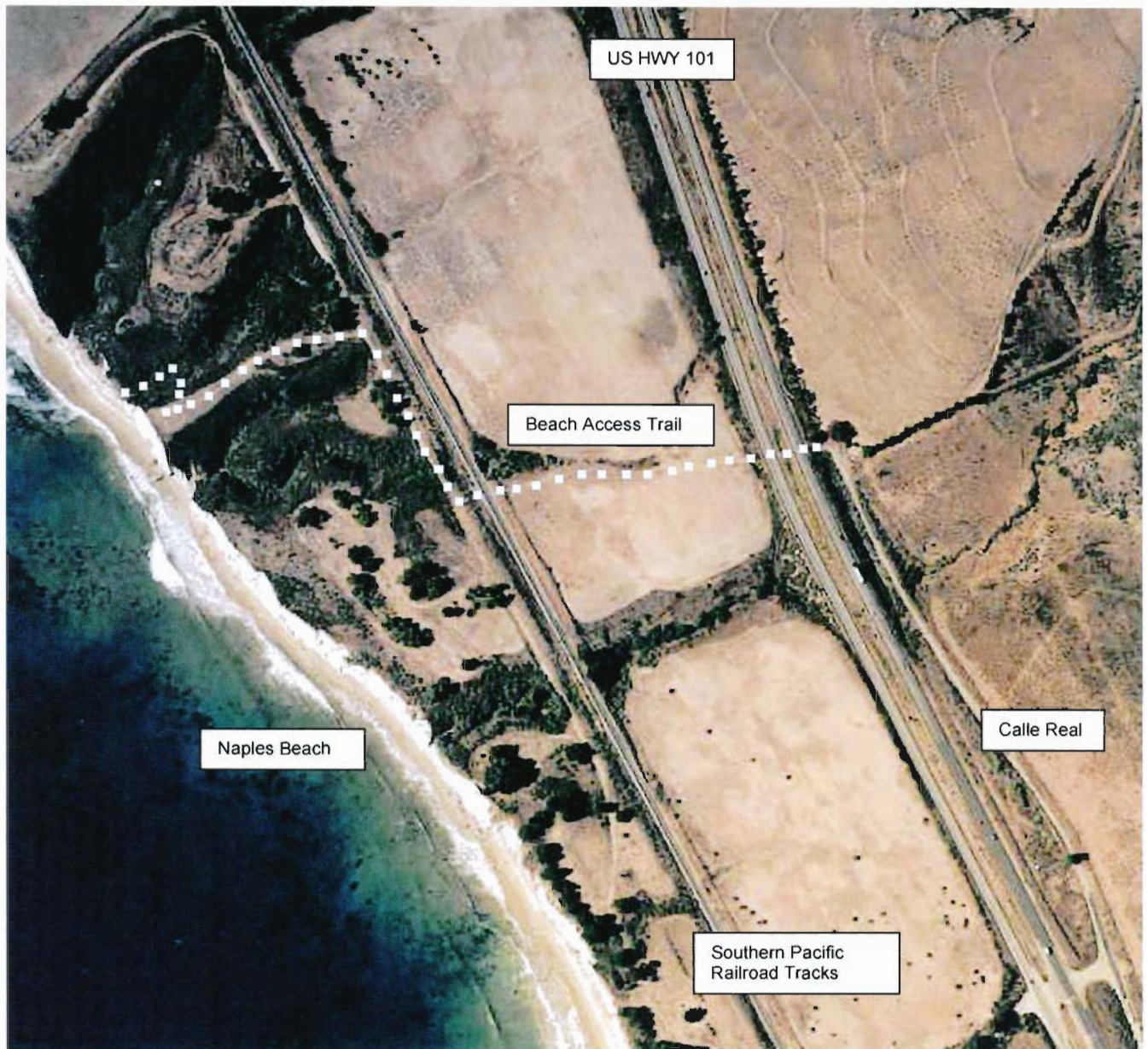
EXHIBIT 2 Aerial Photomap