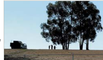
Tree trimmers take a break from their work Monday morning near the Farren Road property where a proposed 13,300-square-foot home would be built.